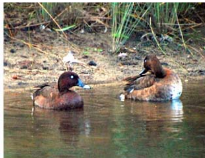
White-eyed Duck (Hardhead)