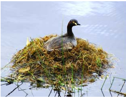
Little (or Australasian) Grebe