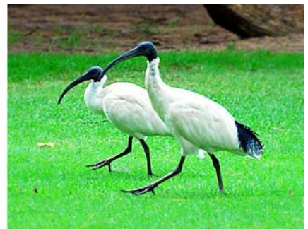
White (or Sacred) Ibis