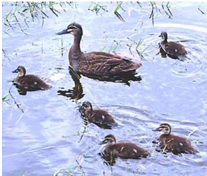
(Pacific) Black Duck

Images manipulated in Photoshop with the highest screen resolution consistent with a manageable file size.