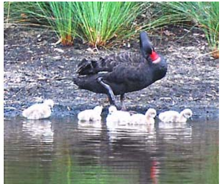
Black Swan and five cygnets