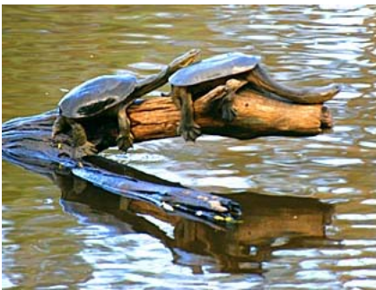
Tortoise (Long-necked Turtle)