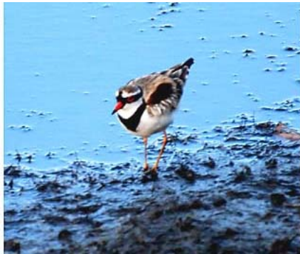
Black-fronted Plover (or Dotterel)