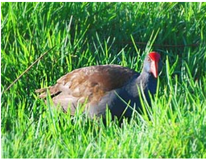
Purple (or Western) Swamphen