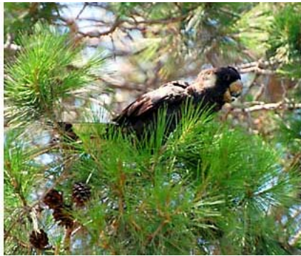
Carnaby's (or White-tailed Black-) Cockatoo