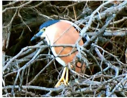
Nankeen (or Rufous) Night Heron