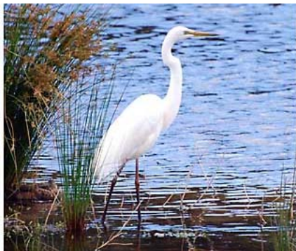
Great (or White) Egret